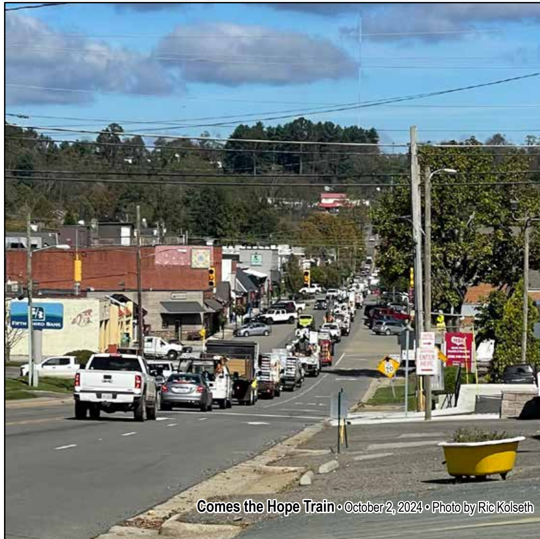
Comes the Hope Train • October 2, 2024

METAL GARAGE DOOR WITH OPENER: 8' metal used sectional garage door with all hardware to include opener (no remote). Door has windows. Must pick up. Asking $100. jont110@gmail.com