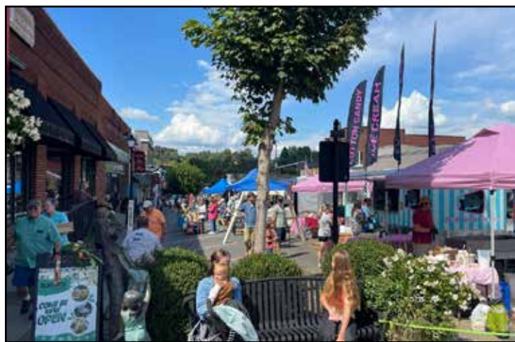
Saturday, September 21: Allie & Bundy and Madison & Claude visit the Fair for some shopping. (Center photo)