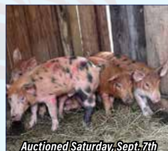
Auctioned Saturday, Sept. 7th

NEXT LIVESTOCK AUCTION SATURDAY, SEPT. 21st, STARTING AT 2:30 PM